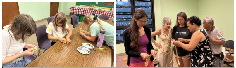
Crafting for a Cause – Tongan Weaving

1020 South Beretania Street Honolulu, Hawaii. 96814-1492 (808) 522-9555. Website: www.firstumchonolulu.org