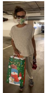
Boxing Day Challenge Donations