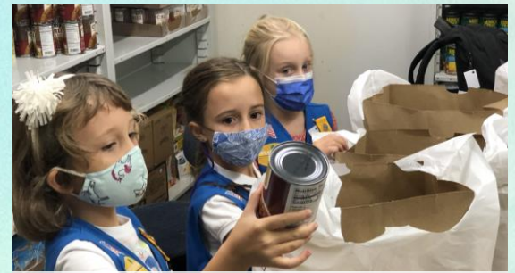
Girl Scouts Foodbank Tour

1020 South Beretania Street Honolulu, Hawaii 96814-1492 (808) 522-9555 Fax (808) 528-3992 Website: www.firstumchonolulu.org