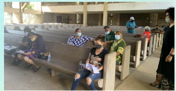
FUMC Vaccination Clinic

1020 South Beretania Street Honolulu, Hawaii 96814-1492 (808) 522-9555 Fax (808) 528-3992 Website: www.firstumchonolulu.org